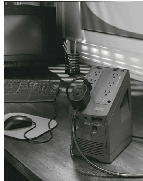
Figure 4: Uninterruptible power supplies Small UPSs can protect home computers from the harmful effects of voltage sags and brief outages.

equipment (including computers) from brief sags and outages, but they may not be suitable for certain equipment such as HVAC and energy management systems. Line-interactive and on-line UPSs may also provide constant voltage regulation and protection from other types of PQ disturbances such as harmonics.