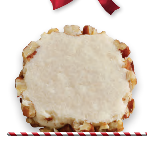
Doreen R. Krueger

Preheat oven to 325 degrees F. Cut each log into ¼-inch slices; place on ungreased cookie sheets. Bake at 325 degrees for 13 to 16 minutes. Cool on wire cooling racks. Makes about 4 dozen.