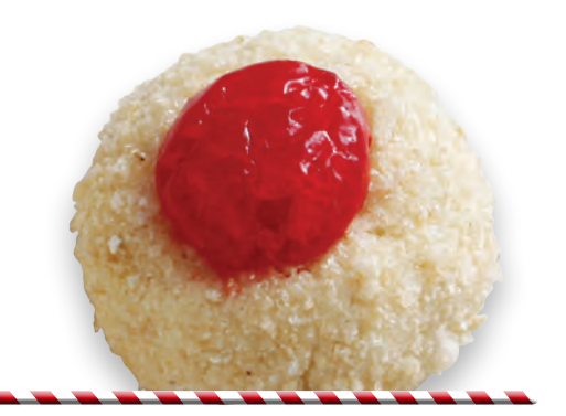
Melany Bentfield Waukesha During the holidays, my grandma and I make Cream Cheese Dainties. My favorite part is rolling the dough and adding the cherry.

Preheat oven to 350 degrees F. In medium bowl, cream butter until fluffy. Add sugars; mix well. Add egg yolks; mix until well incorporated. Stir in flour and oats. Spread mixture into greased 13x9-inch baking pan. Bake at 350 degrees for 18 to 20 minutes; cool. Melt chocolate and butter in a double boiler or small saucepan over low heat. Spread chocolate mixture over cooled bars; top with nuts while chocolate is warm. Allow chocolate to cool before cutting into bars. Makes about 4 dozen.