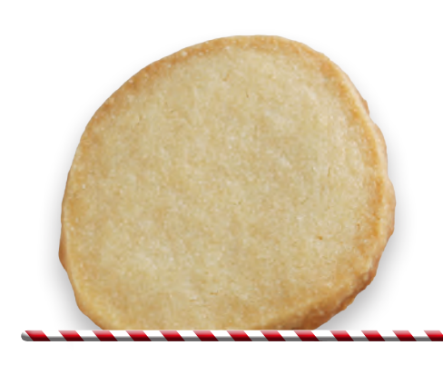
Sandi M. Clark Jefferson

Preheat oven to 375 degrees F. Cut rolls into \frac{1}{4} -inch slices; place on parchment paper-lined cookie sheets. Bake at 375 degrees for 10 to 12 minutes. Cool on wire cooling racks. Makes about 4 dozen.