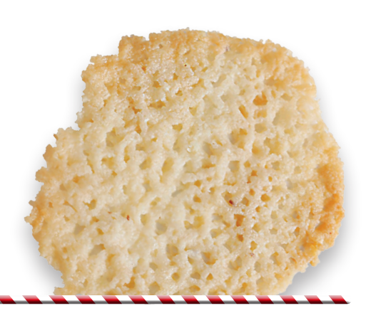
The Nevins Sisters