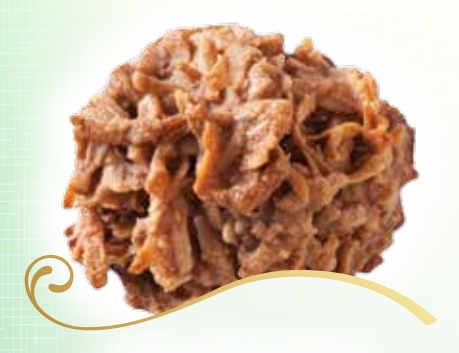
WILL DANOFF Fidelity Investment Management

Preheat oven to 375 degrees F. In mixing bowl, cream butter and brown sugar; beat in eggs and vanilla. In separate bowl, combine flour, baking soda and salt; gradually add to creamed mixture. Stir in cranberries, nuts and chips. Drop by tablespoonfuls onto ungreased cookie sheets. Bake at 375 degrees for 9 to 11 minutes. Cool on wire cooling racks. Makes about 4 dozen.