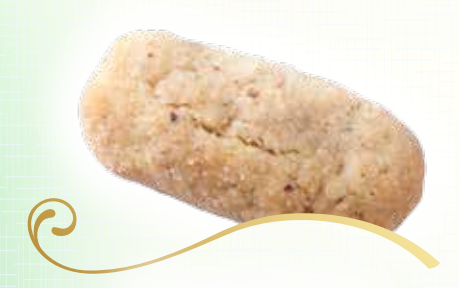
MARK MONE University of Wisconsin-Milwaukee

Cool cookies on pan for 1 to 2 minutes, then transfer to wire cooling racks. When cooled, place a few cookies in a plastic bag with powdered sugar; lightly shake to cover each cookie. Makes about 8 dozen.