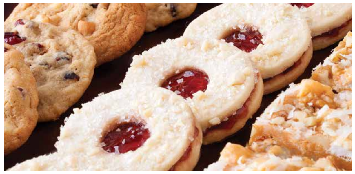
Shown on cover: Cranberry Macadamia Nut Cookies (p. 4) Jelly Sandwich Cookies (p. 16) Marshmallow Bars (p. 19)