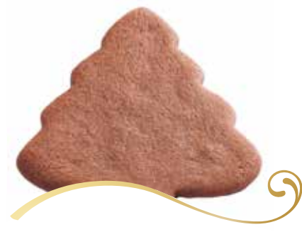
MATT LEVATICH Harley-Davidson Motor Co.

In mixing bowl, whisk eggs, flour, lemon juice, lemon peel, baking powder and salt until well combined.