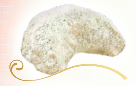
GALE KLAPPA WEC Energy Group