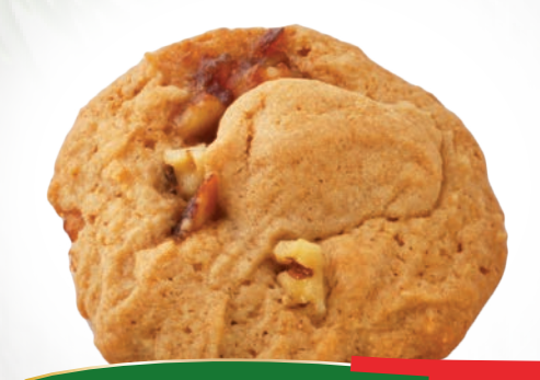
MUSTANG, OKLAHOMA Barbara Buchholtz

Preheat oven to 350 degrees F. In mixing bowl, cream butter, sugar and vanilla. Add chips and pecans. Stir in flour. Roll tablespoonfuls of dough into balls; place on ungreased cookie sheets. Flatten with bottom of glass dipped in sugar. If desired, decorate with colored sugar, cherry or pecan halves. Bake at 350 degrees for 11 to 14 minutes. Cool on wire cooling racks. Makes about 4 dozen.