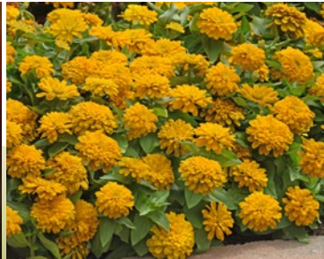
Zesty™ Yellow Zinnia ( Zinnia elegans ) 18-24" x 18-24", vibrant yellow, fully double flowers