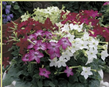
Saratoga™ Mix Nicotiana ( Nicotiana alata ) 10-12" tall and wide, multi colored, heat tolerant