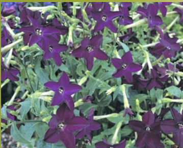
Perfume Deep Purple Nicotiana ( Nicotiana x sandarae ) 16-18", deep purple, fragrant, star-shaped flowers, heat tolerant