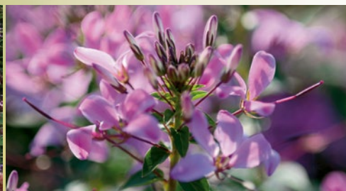
Señorita Rosalita® Spider Flower ( Cleome ) 24-48" x 18-24", eye catching lavender-pink flowers, will not self-seed, full upright habit