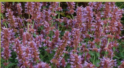
Kudos Silver Blue Agastache ( Agastache ) 18-24" x 24", light blue flowers