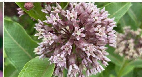
Common Milkweed ( Asclepias syriaca ) 2-4' tall, ball-shaped umbels of fragrant, lavender-pink flowers, plant will colonize by spreading rhizomes