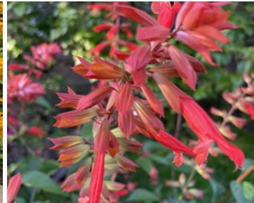
Skyscraper™ Orange Salvia ( Salvia hybrid ) 14-28" x 10-16", bright orange flowers