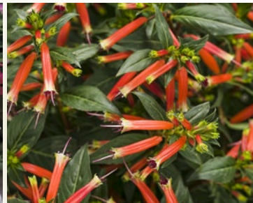
Vermillionaire® Firecracker Plant ( Cuphea ) 18-28" x 12-24", vibrant red-orange flowers