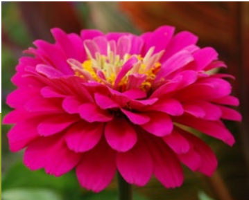
Uproar™ Rose Zinnia ( Zinnia elegans ) 28-36" x 24", upright branching, 4-5" bright magenta fully double flowers