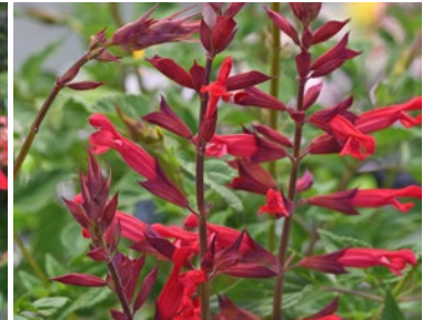
Roman Red Salvia ( Salvia splendens x S. darcyi ) 28-34" x 28-36", vibrant red flowers