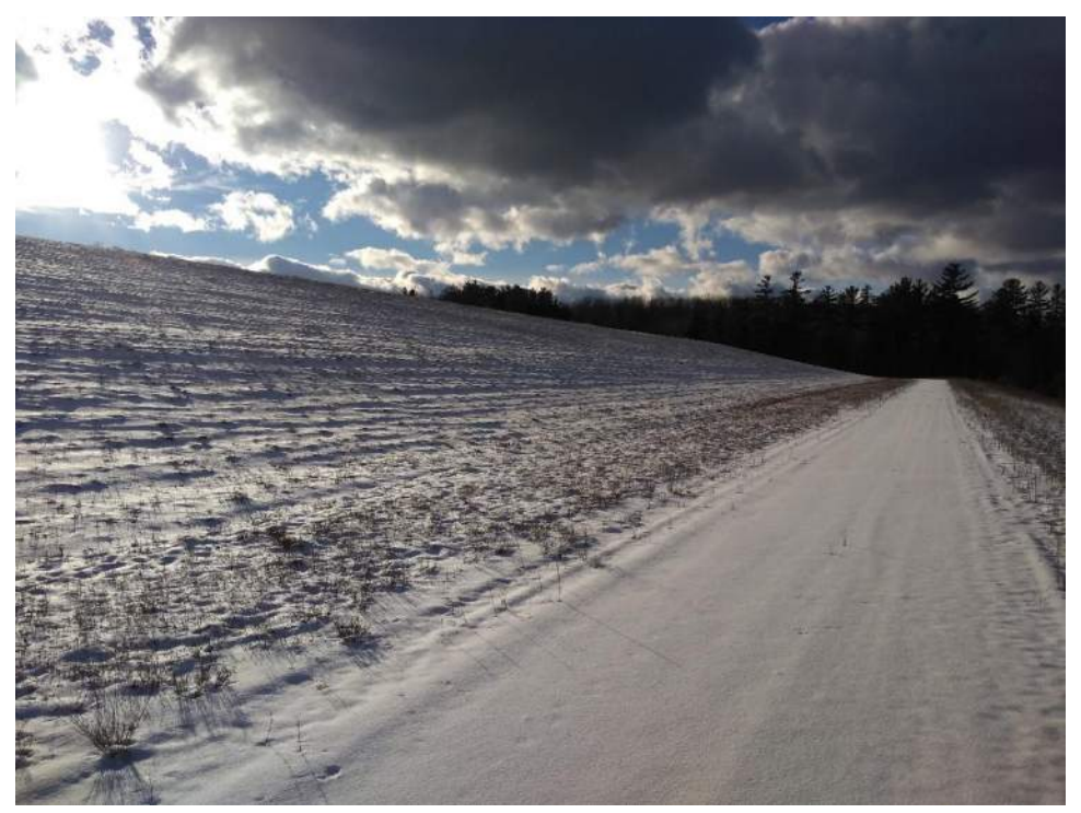
Photo No. 1: Toe of north slope of the PIPP Landfill No. 3, looking west.