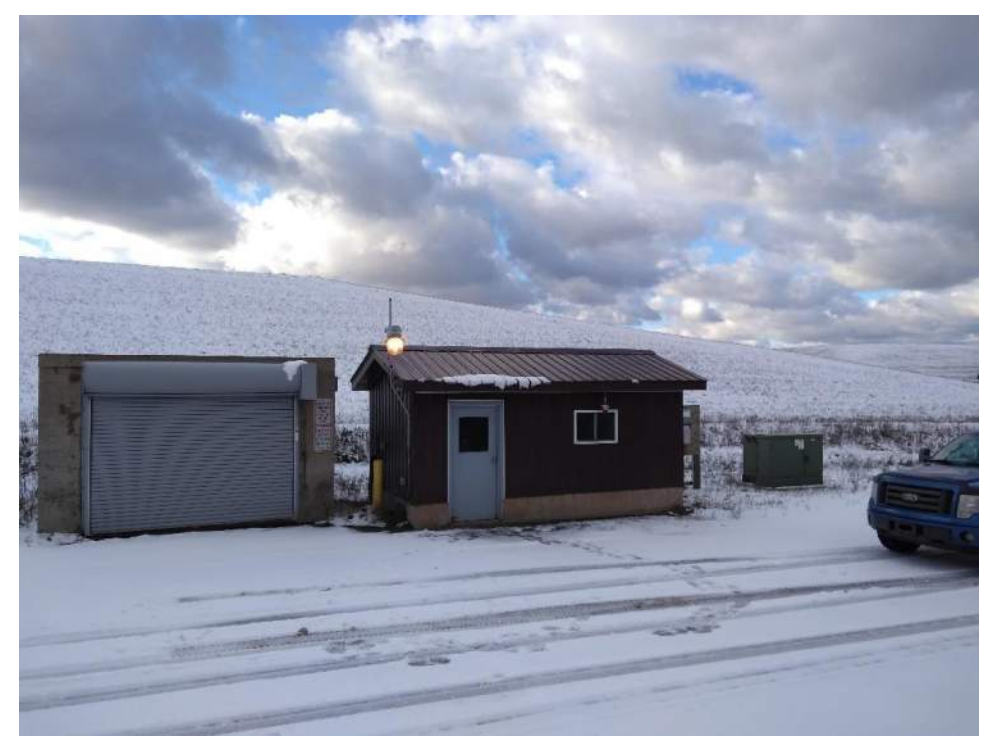
Photo No. 12: Leachate control box shed on the east side of the PIPP Landfill No. 3.