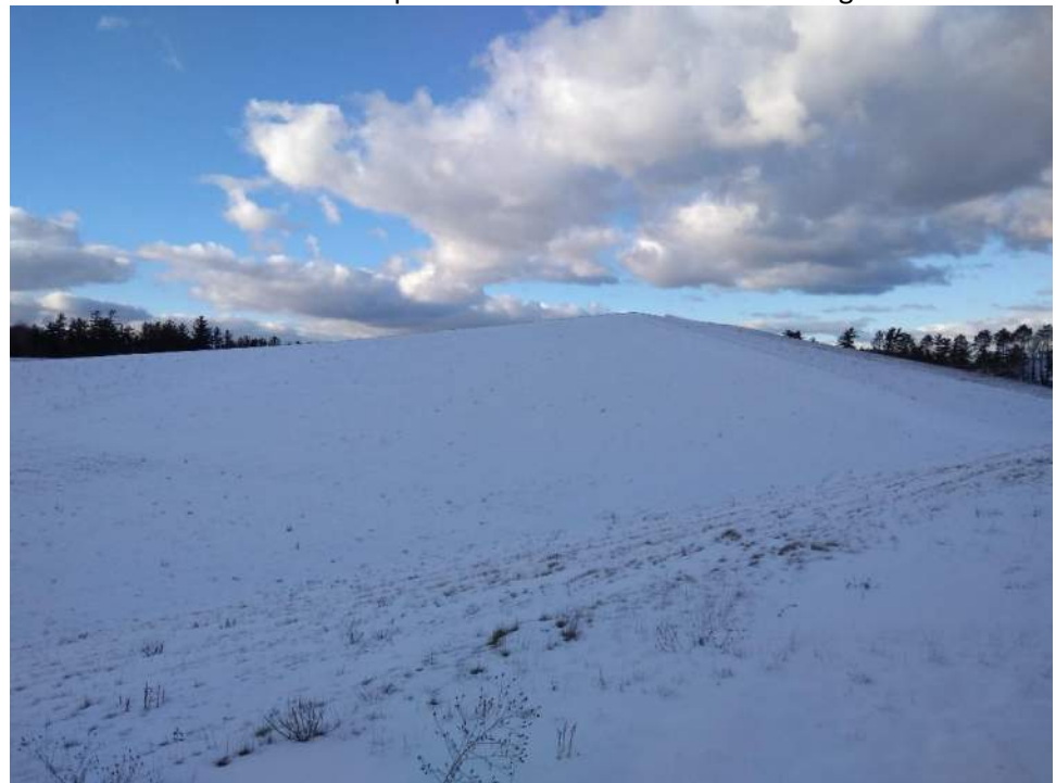
Photo No. 10: East slope of the PIPP Landfill No. 3 looking northwest.