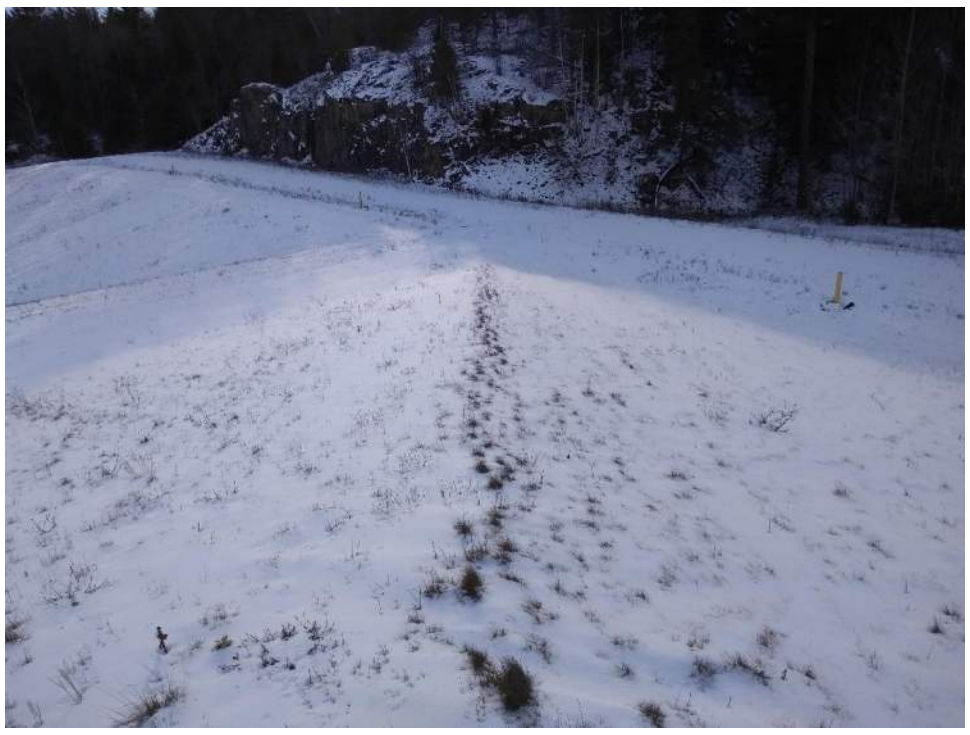
Photo No. 5: Corner of the west and south slope at the PIPP Landfill No. 3, looking southwest.