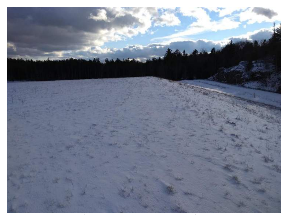
Photo No. 4: Crest of the west slope at the PIPP Landfill No. 3, looking south.