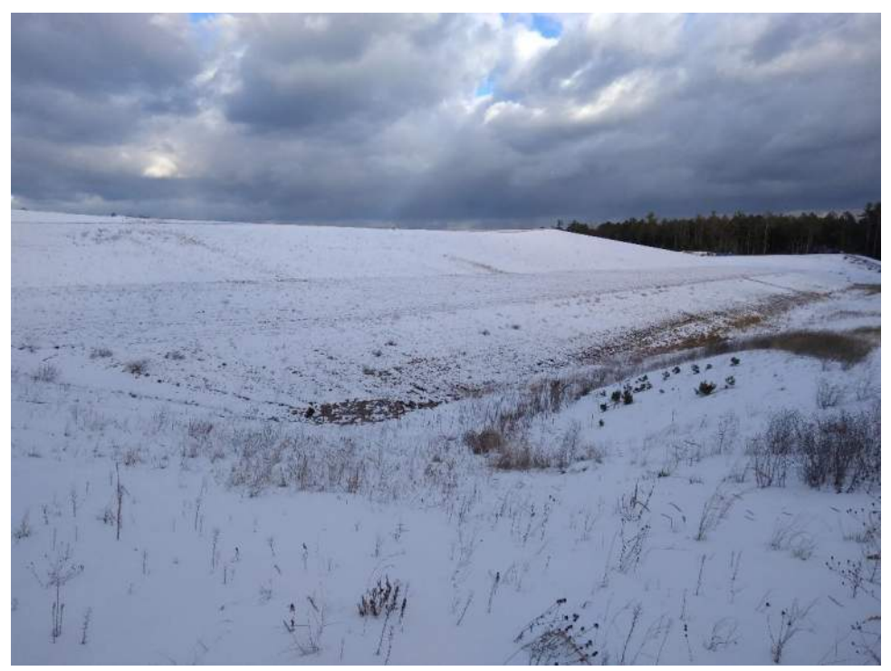
Photo No. 7: South slope of the PIPP Landfill No. 3 looking northeast.