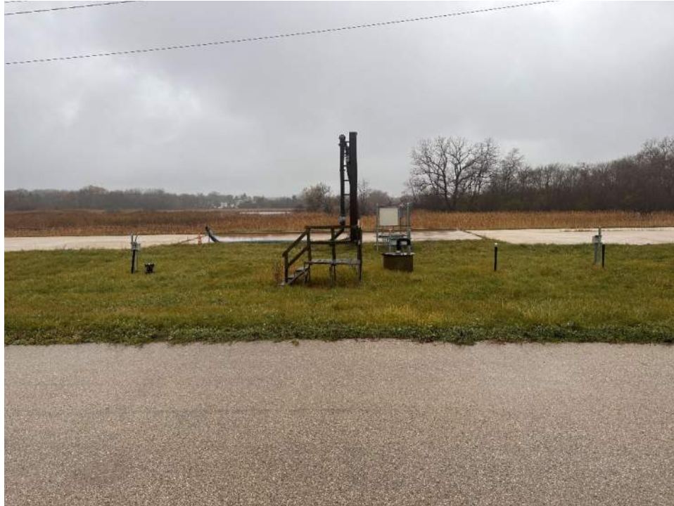
Photo No. 3 – Looking west from the Cell 1 cover at the leachate loadout pad.