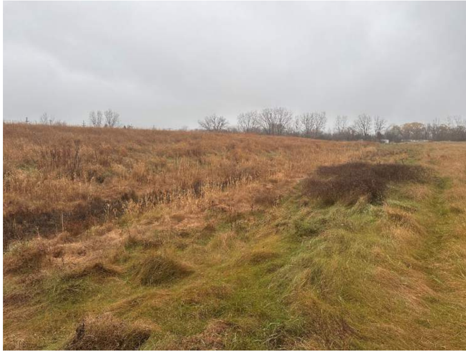
Photo No. 5 – South slope of Cell 1 and perimeter stormwater ditch, looking east.