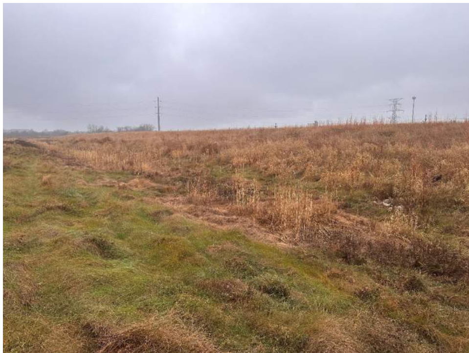
Photo No. 6 – South slope of Cell 1 and perimeter stormwater ditch, looking west.