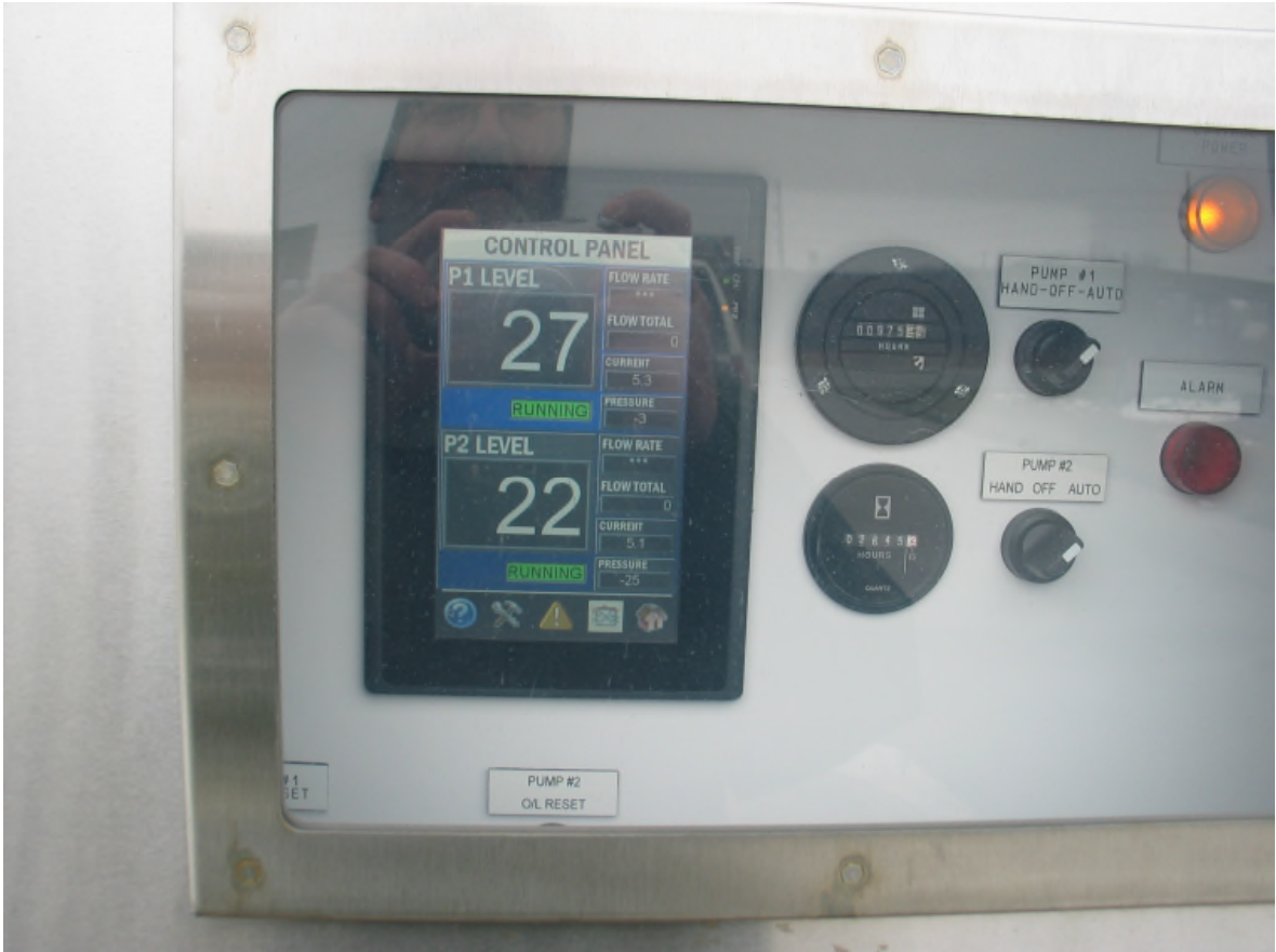
Sideslope riser pump panel