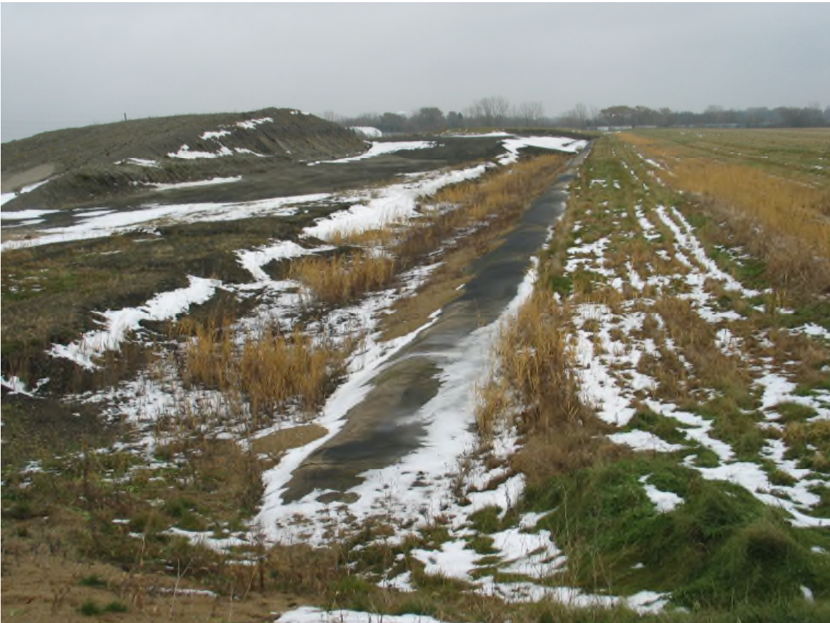
Intercell (south) berm (looking east)