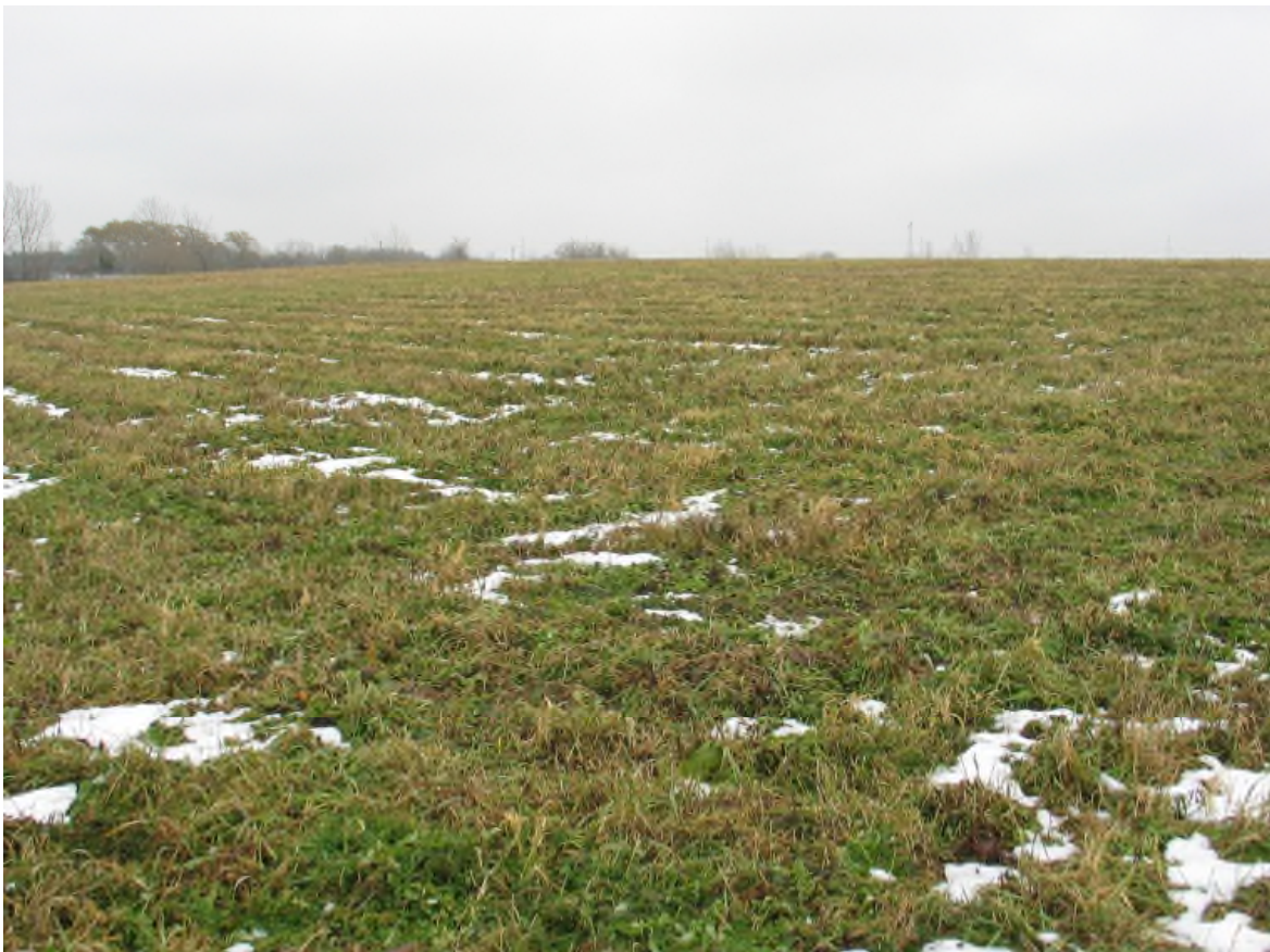
Final cover east end