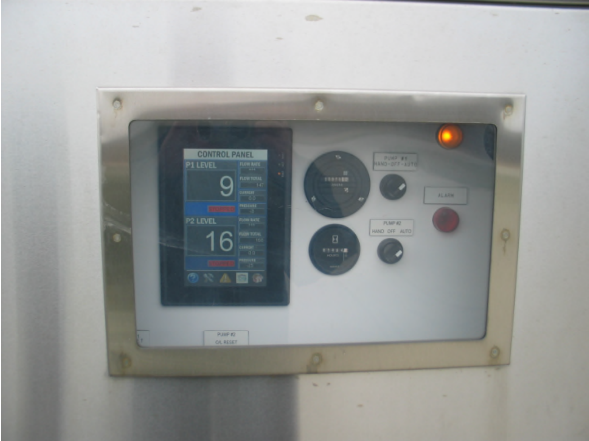
Sump Transducer Readings/Control Panel