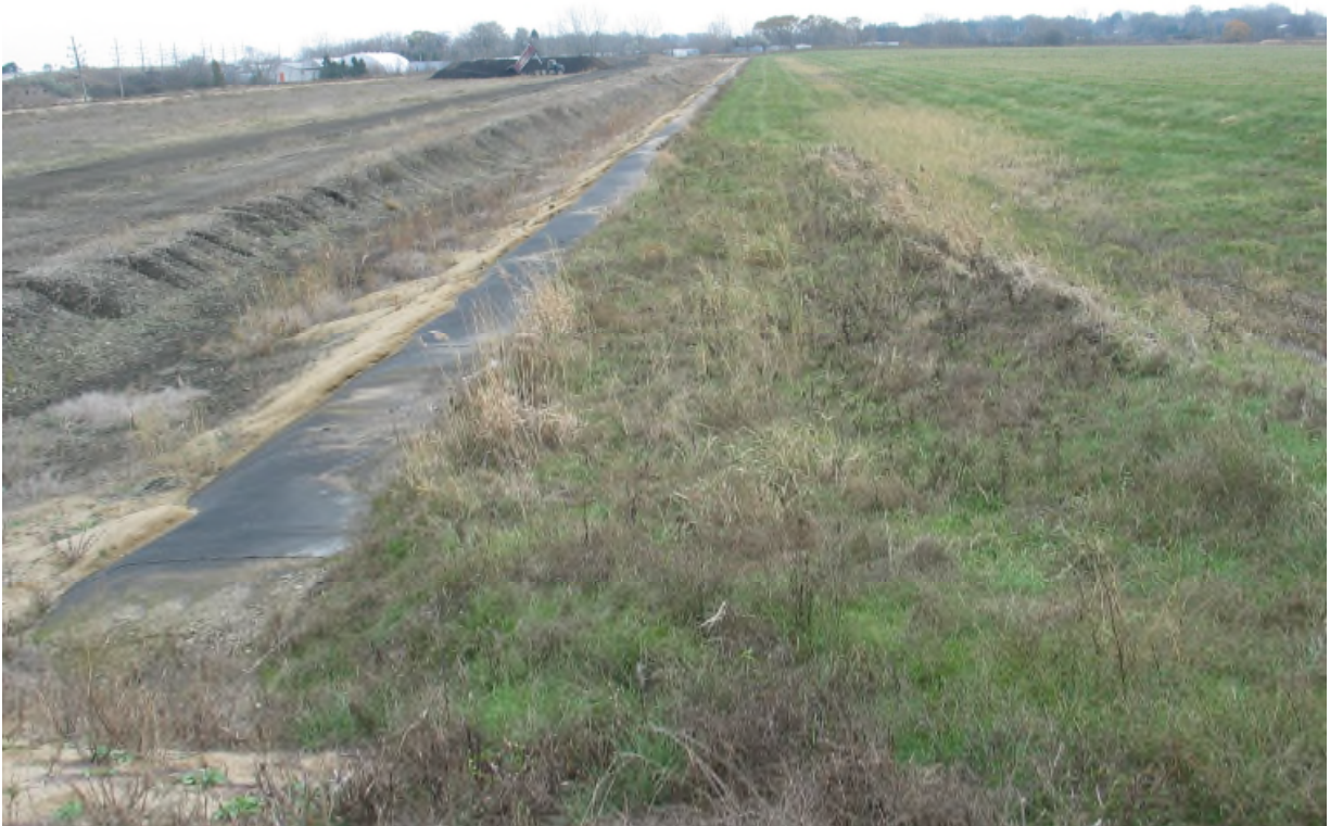
West End Intercell Berm (looking east)