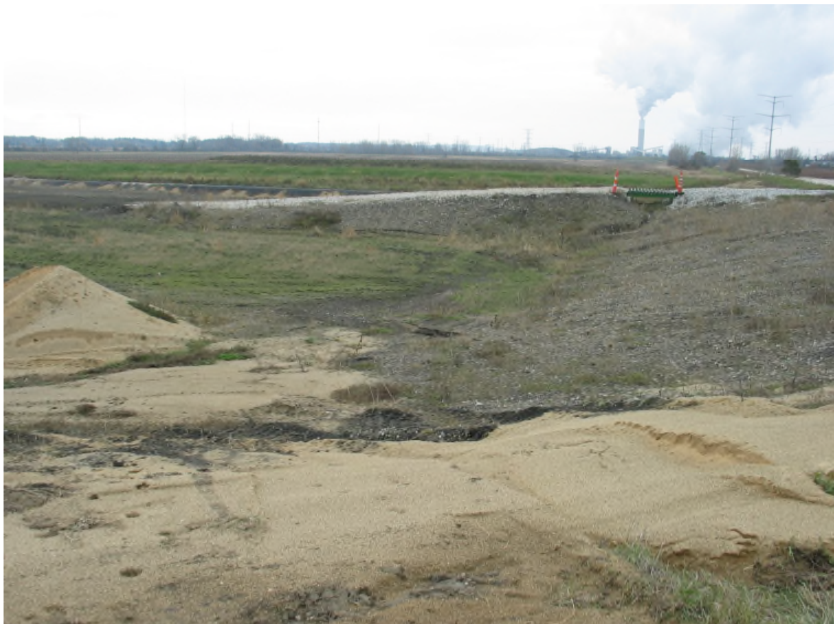
Northeast Corner Cell 1 (looking south)