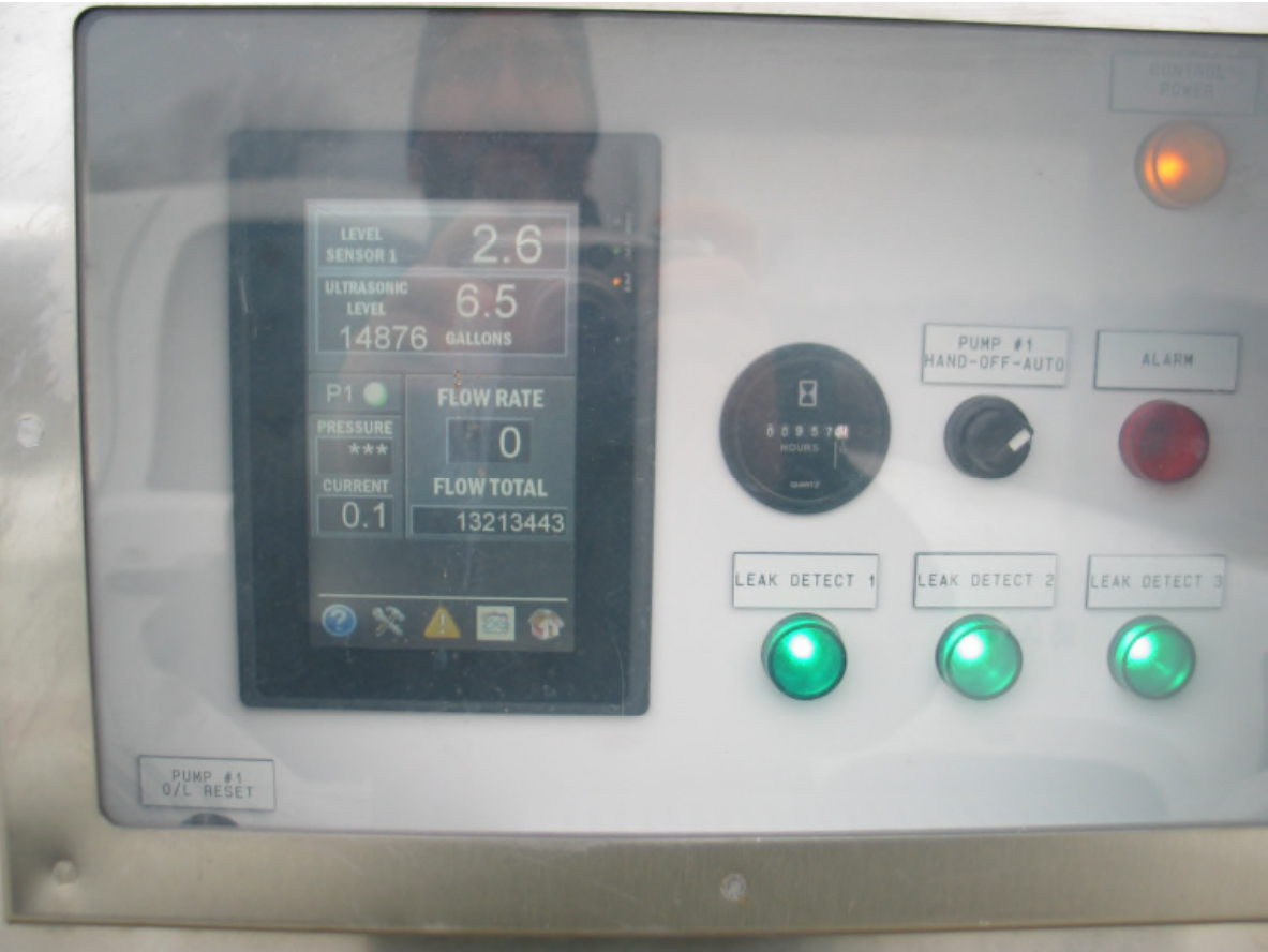
Leachate Load-Out Panel