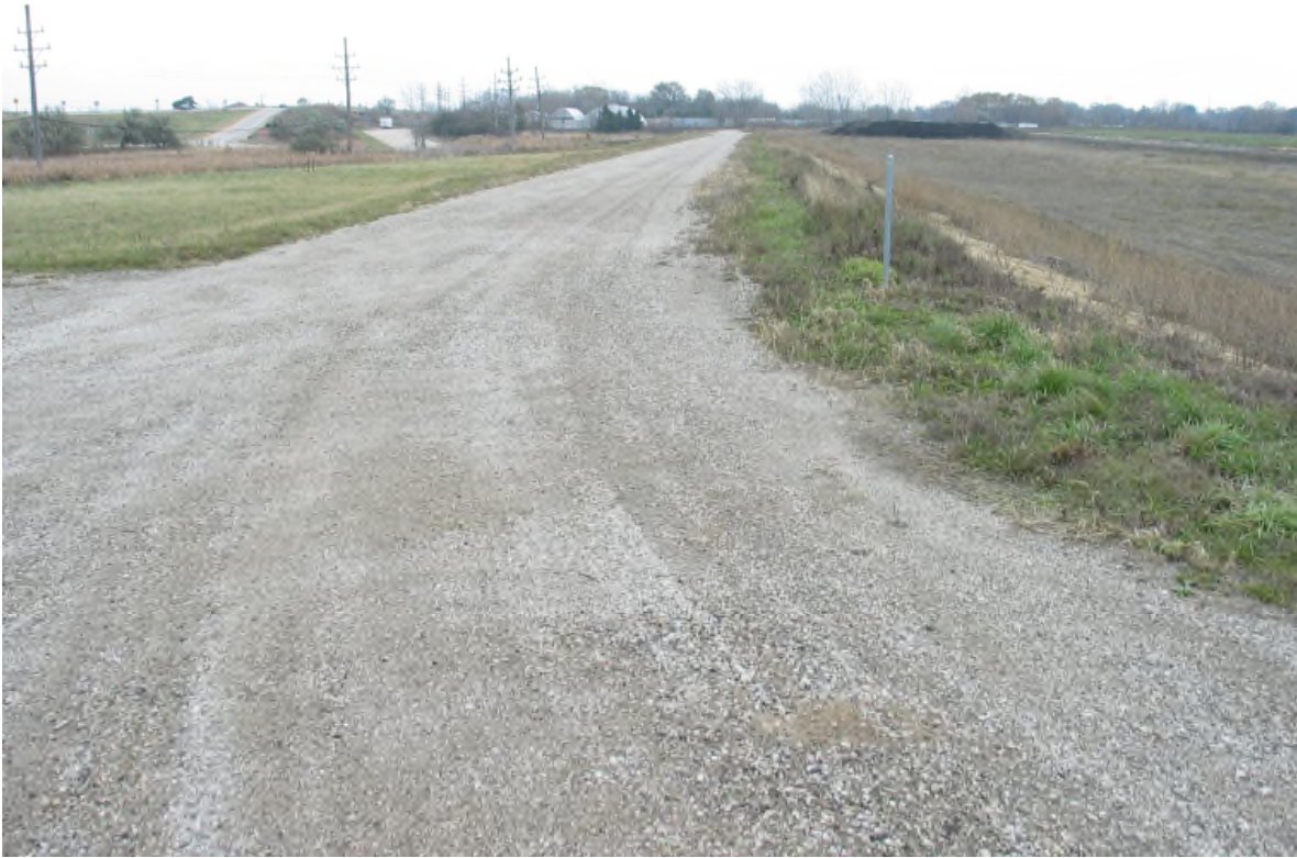
Northwest Corner Cell 1 (looking east)