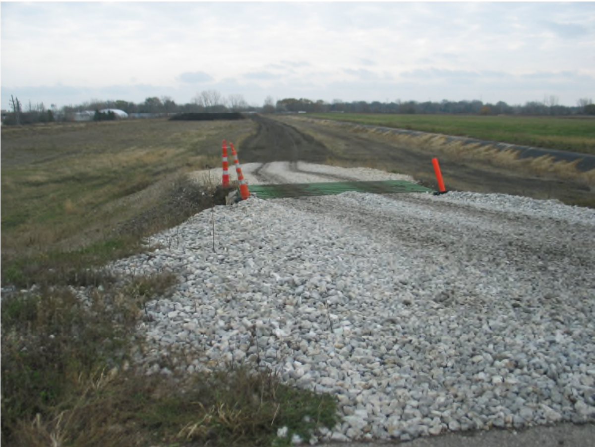
Cell Entrance (looking east)