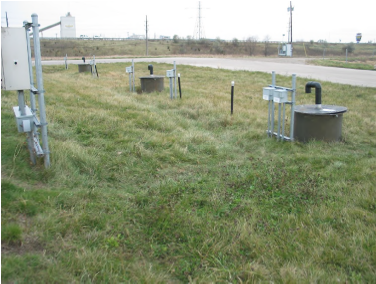
Leachate Storage Tank Area (looking north)