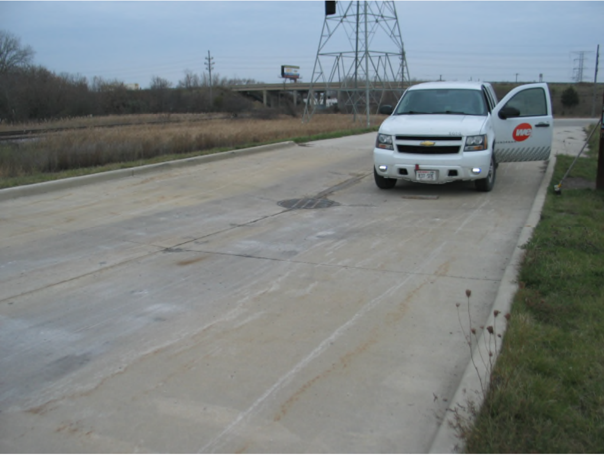
Leachate Loadout Pad (looking north)