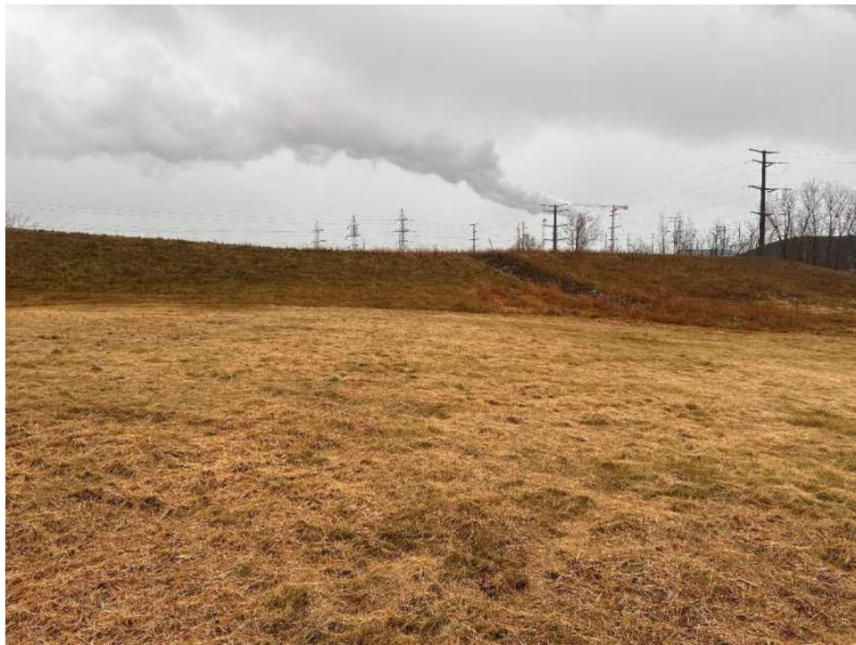
Photo No. 12 – Vegetated soil stockpile located north of the landfill.