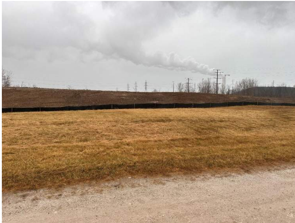
Photo No. 11 – New topsoil stockpile located north of the landfill.