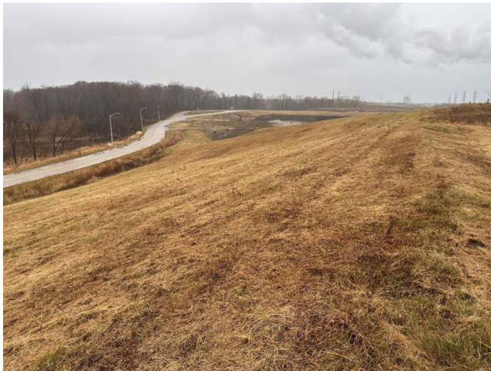
Photo No. 4 – West perimeter berm and stormwater collection ditch, looking north.