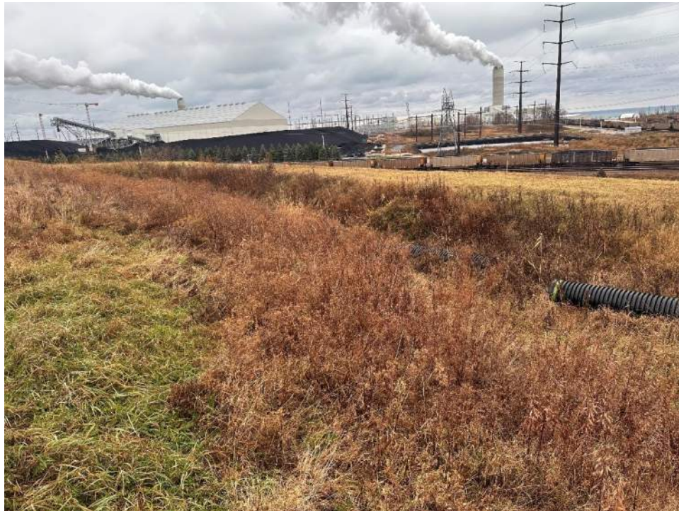
Photo No. 3 – Leachate collection ditch behind Cell 6 and 8 partial cover.