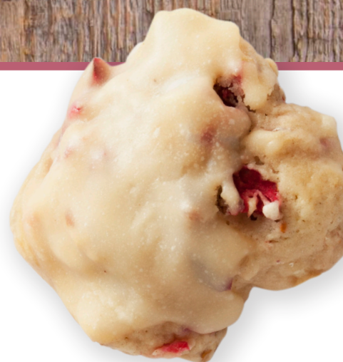
Mary B. Brown Glacial Lake Cranberries

In small saucepan, heat butter over low heat until golden brown; cool slightly. Stir in sugar and vanilla. Beat in water until smooth and of a thin consistency.