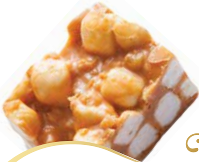
JACK LINK Link Snacks Inc.

Preheat oven to 350 degrees F. In mixing bowl, cream butter and sugars. Add eggs and vanilla; mix well. In separate bowl, combine flour, baking powder, baking soda, cinnamon and salt; add to creamed mixture. Stir in oats, chocolate chips, coconut and pecans. Drop by ¼-cupfuls 3 inches apart onto parchment paper-lined cookie sheets. Bake at 350 degrees for 12 to 14 minutes, or until edges are set. Cool on cookie sheets. Makes about 3 dozen.