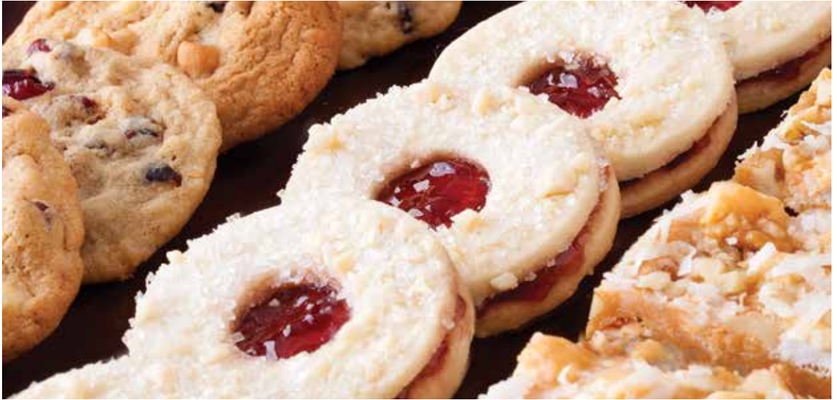
Shown on cover: Cranberry Macadamia Nut Cookies (p.4) Jelly Sandwich Cookies (p. 16) Marshmallow Bars (p.19)