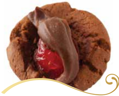
TODD TESKE Briggs & Stratton