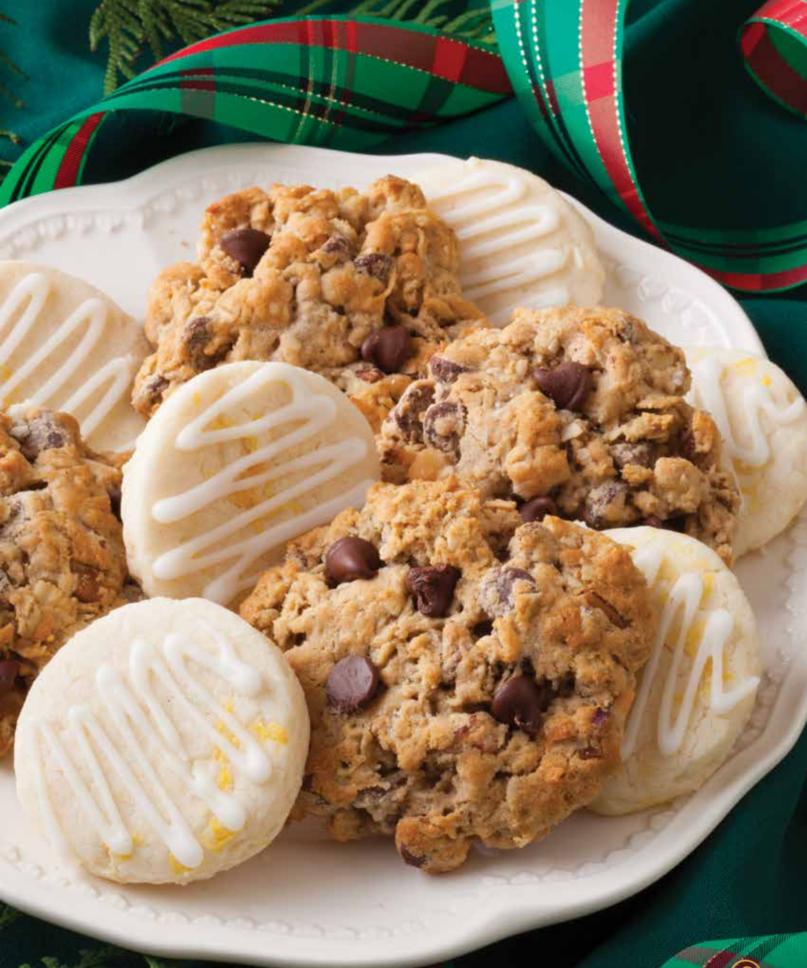
Lemon Shortbread Cookies (p. 11) Cowboy Cookies (p. 19)