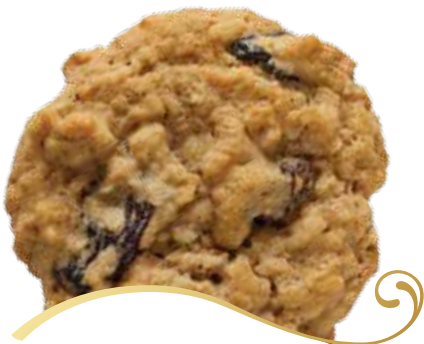
JASON AND PORSCHLA KIDD Milwaukee Bucks

Preheat oven to 350 degrees F. In mixing bowl, cream butter and sugar. Add egg yolks and vanilla; mix well. In separate bowl, combine flour, baking powder and salt. Add to creamed mixture and mix well to make dough. Combine ⅓ cup dough with pecans, syrup and maple flavoring, if desired. Set aside. Press remaining dough through cookie press fitted with a wreath disk onto ungreased cookie sheets. Spoon about ¾ teaspoonful of pecan mixture into centers. Decorate with pieces of cherries. Bake at 350 degrees for 8 to 10 minutes. Cool on wire cooling racks. Makes about 5 dozen.