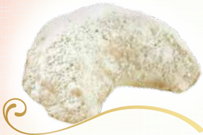
GALE KLAPPA WEC Energy Group