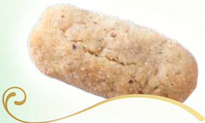
MARK MONE University of Wisconsin-Milwaukee

Cool cookies on pan for 1 to 2 minutes, then transfer to wire cooling racks. When cooled, place a few cookies in a plastic bag with powdered sugar; lightly shake to cover each cookie. Makes about 8 dozen.