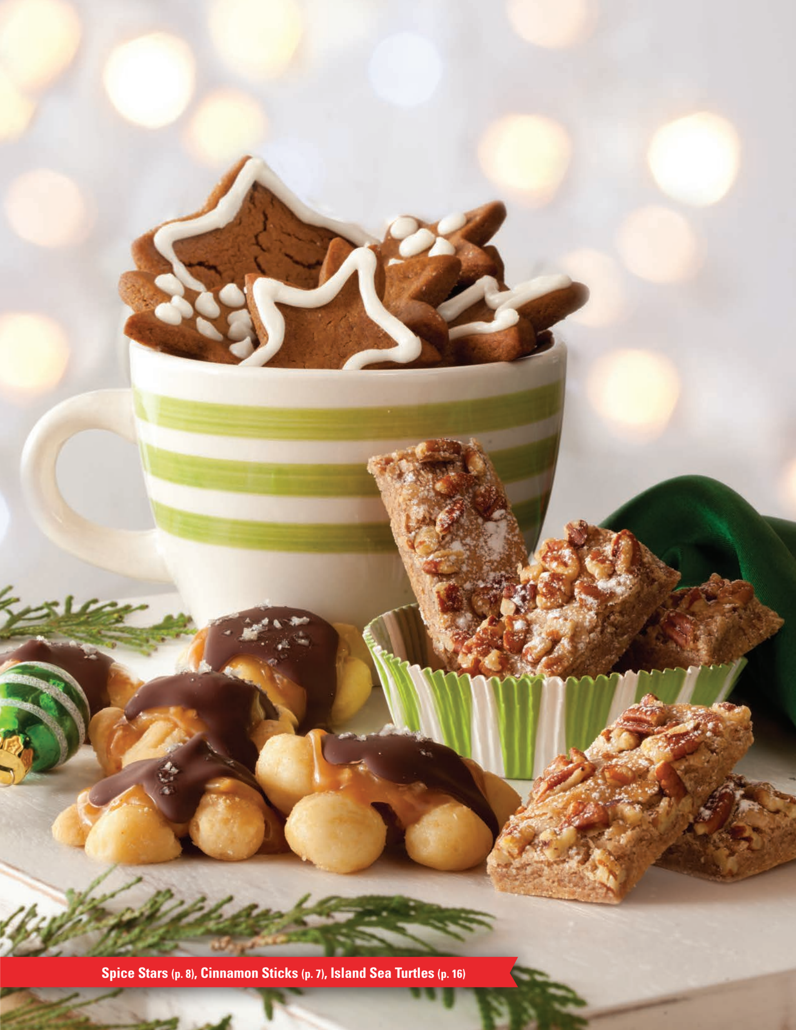
Spice Stars (p. 8), Cinnamon Sticks (p. 7), Island Sea Turtles (p. 16)