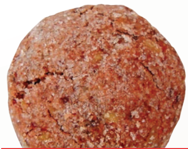
Barb Grueschow, Menomonee Falls, Wis.

In microwave-safe bowl, combine chocolate and cream; microwave for 1 minute at 20-second intervals, stirring after each until chocolate is melted; stir until smooth.