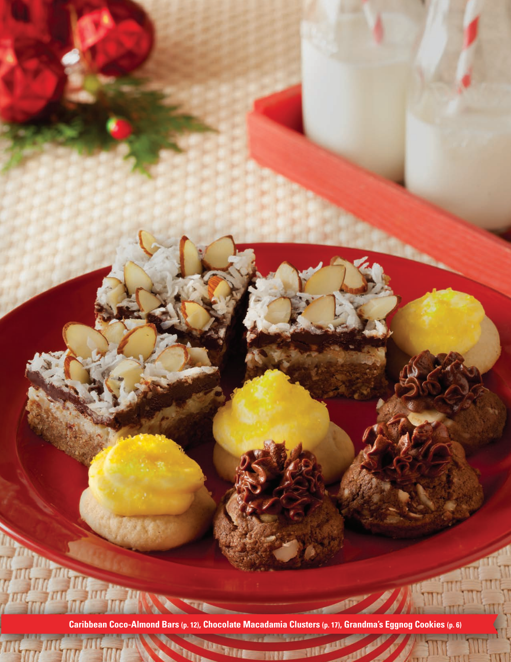
Caribbean Coco-Almond Bars (p. 12), Chocolate Macadamia Clusters (p. 17), Grandma's Eggnog Cookies (p. 6)