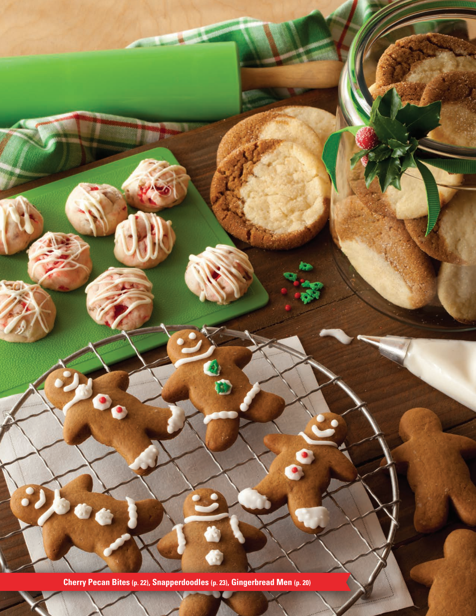
Cherry Pecan Bites (p. 22), Snapperdoodles (p. 23), Gingerbread Men (p. 20)