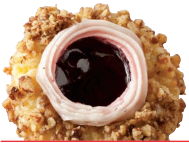
Dawn Schlueter, Mukwonago, Wis.

In small bowl, whisk together sugar, milk and vanilla until smooth.