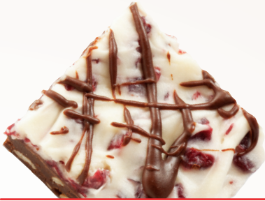
From the chefs of the Wisconsin Milk Marketing Board