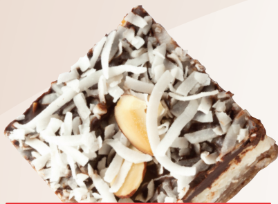
From the chefs of the Wisconsin Milk Marketing Board

Place peanuts, chips, chocolate and almond bark in slow cooker. Cover and cook on low 2 hours; mix well. Spoon peanut mixture into paper-lined miniature muffin cups; sprinkle with salt. Refrigerate until set. Makes about 7 dozen.