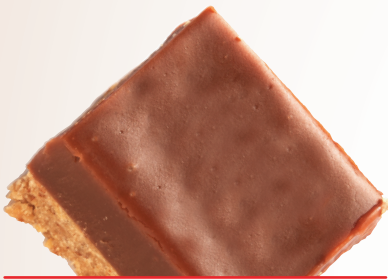
From the chefs of the Wisconsin Milk Marketing Board

Preheat oven to 350 degrees F. In mixing bowl, cream butter and sugars. Add eggs and vanilla; mix well. In separate bowl, combine flour, salt and baking soda; add to butter mixture. Stir in chocolate chips, pecans and almonds. Drop by rounded tablespoonfuls onto ungreased or parchment paper-lined cookie sheets. Bake at 350 degrees for 12 to 15 minutes. Cool on wire cooling racks. Makes about 4 dozen.