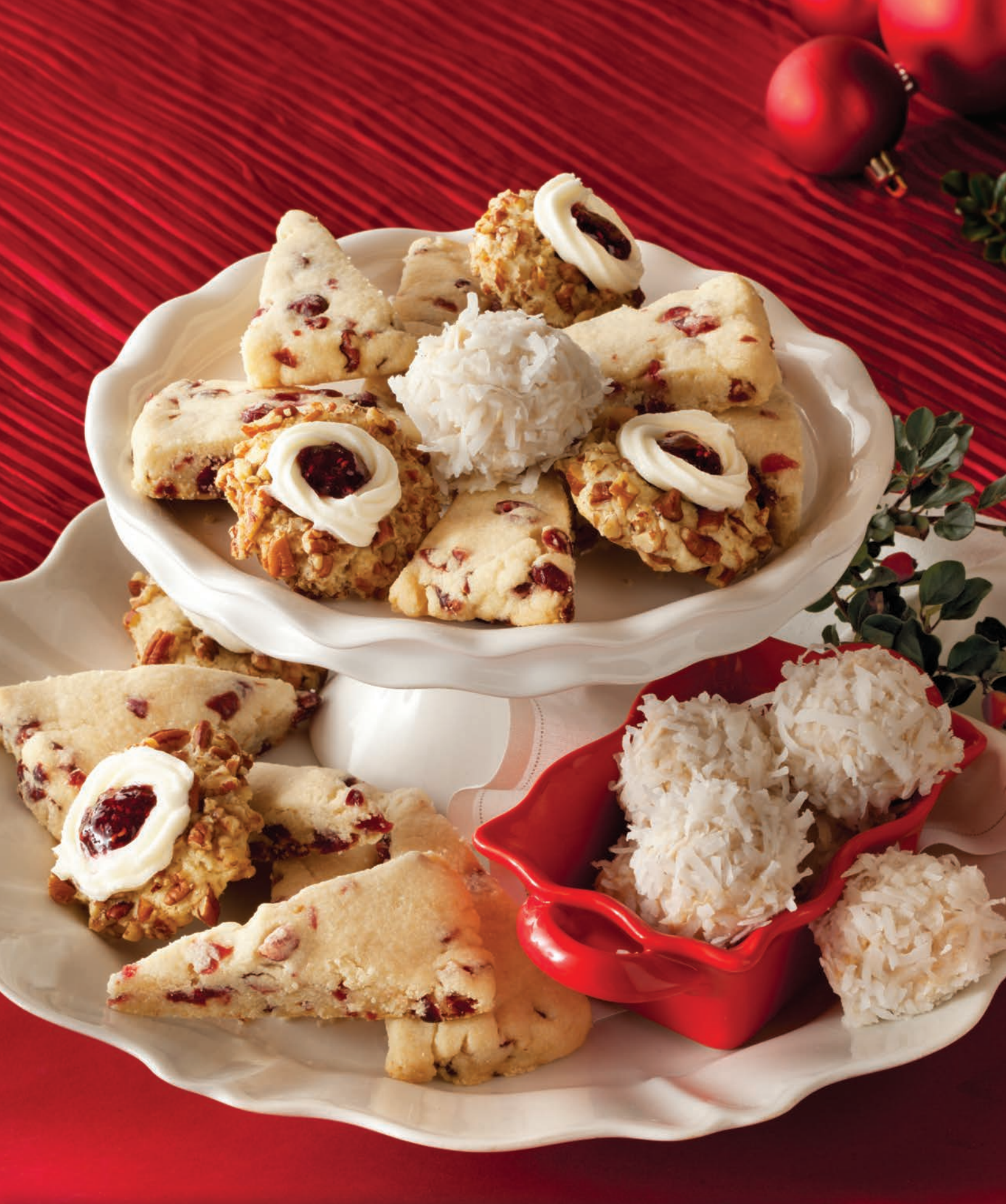
Zingy Cranberry Shortbread Cookies (p. 20), Peanut Butter Snowballs (p. 4), Polish Tea Cakes (p. 4)