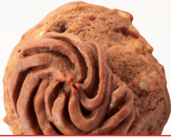
From the chefs of the Wisconsin Milk Marketing Board