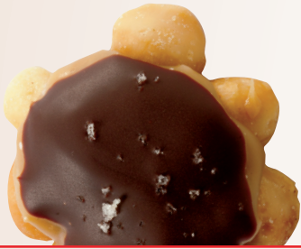
From the chefs of the Wisconsin Milk Marketing Board

Line a 13 x 9-inch baking pan with foil; grease foil with butter. In large Dutch oven, combine butter, milk and sugar; bring to a boil. Boil and stir 5 minutes; remove from heat. Add chocolates; stir until melted. Add marshmallow crème, vanilla and salt; mix until combined. Fold in pecans. Pour into prepared pan. Let cool. Use foil to lift fudge from pan; cut into squares. Makes about 5 pounds.