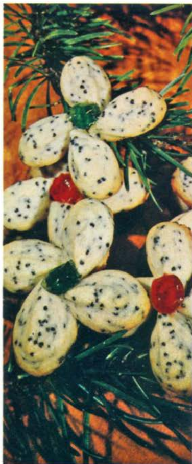
POPPY SEED SPRITZ COOKIES • Page 25