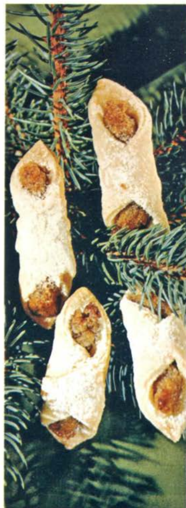
WALNUT FILLED TREATS • Page 25