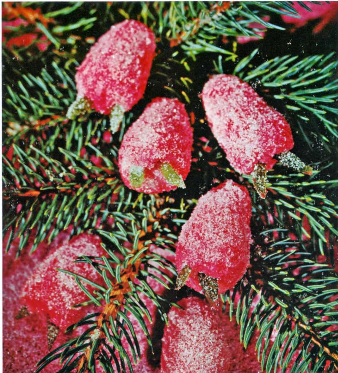
STRAWBERRY CONFECTIONS • Page 25

Enjoy the pure comfort of TOTAL ELECTRIC LIVING