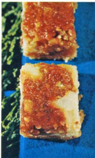
CHEESECAKE-IN-BETWEEN BARS • Page 3