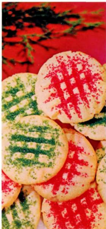
FESTIVE BUTTER COOKIES • Page 16