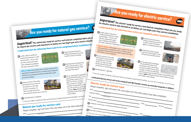
How do we know you're ready for service?

We will provide you with ready for service cards – one for electric installation and another for natural gas installation. When all of the requirements are met , send in your card(s) and we will schedule construction.